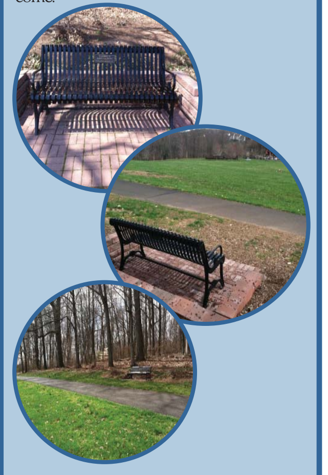
Central Park - overlooking Kid's Castle (sold out)

A bench donation in Doylestown Township can help you do just that. Not only is it a special dedication to someone, but it can be enjoyed by the community for years to come.