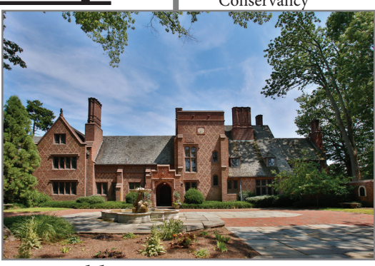
Aldie Mansion 2018 Home for Heritage Conservancy, a nonprofit membership organization whose mission is to preserve and protect our natural and historic heritage. It is also a premier wedding venue.