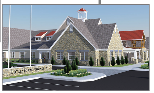
Proposed new township building 2018