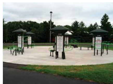
Right: Central Park Life Trail