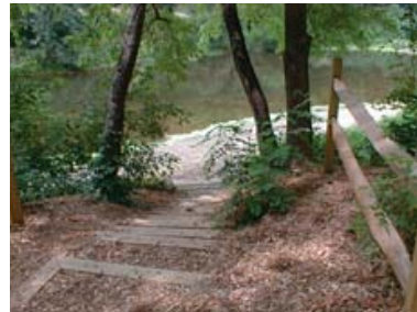
Left: Castle Valley Park

A lot has been happening in the Parks Department the past few months. Parks maintenance staff has been completing the fall chores such as aerating, fertilizing, overseeding sports fields, trimming trees in the parks and along the Bike and Hike system, removing leaves and debris from Township areas and the list goes on. They've also been busy crack sealing the tennis courts, basketball courts and trails. Beyond these activities, they've been keeping up with mowing and maintenance of retention basins and open space in the Township as well as fencing and providing signage for the Sauerman Park pond.