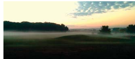
Left: Sunrise over Central Park