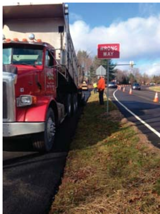
Right: Heritage Trail Construction

Public works is just as busy as ever. From the Chairman's article, it is clear to see they have quite a lot to do around the Township. Below are some pictures of their recent projects, including construction of the Heritage Trail and leaf and yard waste recycling with the Township's new tub grinder acquired through grant funds.