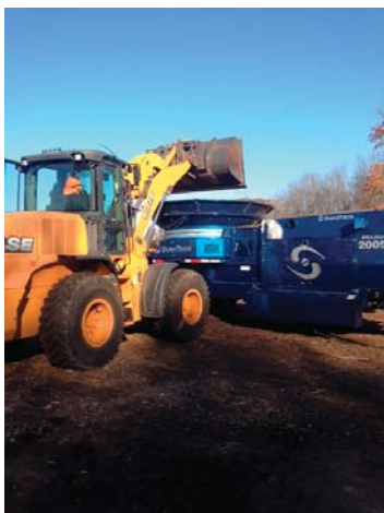
Right and Below: Loading the tub grinder for the leaf and yard waste recycling program