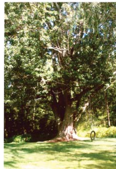
Record Tree: Red Maple