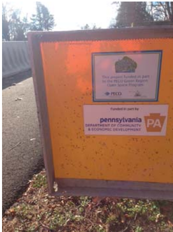
Left: Sponsor Signage