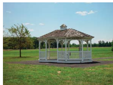
Left: Turk Park Gazebo