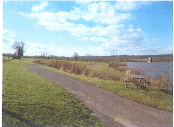
Existing Walking/Bicycling Trail at Peace Valley Park

The following map shows the amenities and public facilities available at Peace Valley Park: