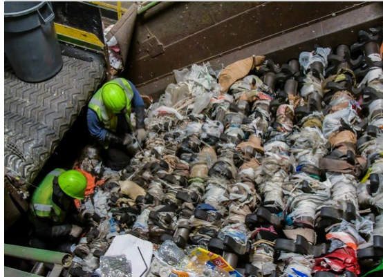
Workers removing tangled plastic bags from equipment.