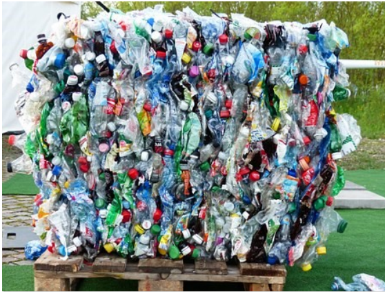
Baled plastic bottles to be sold.