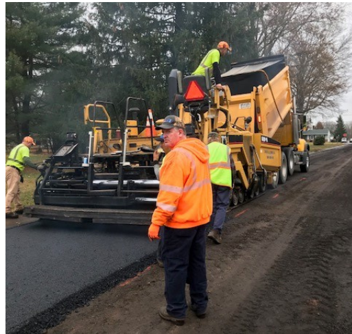
Base pavement being laid