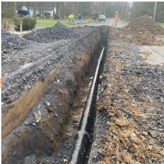
Water Line Being Installed

How to connect to water & sewer can be found on the websites below: