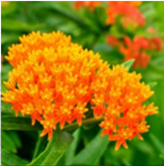
Butterfly Weed (Asclepias tuberosa)

Information collected from USFS, Penn State Extension, and DCNR.