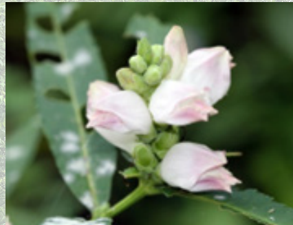
Turtlehead (Chelone glabra)