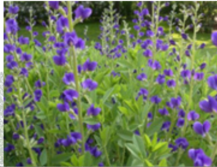
Blue Wild Indigo (Baptisia australis)