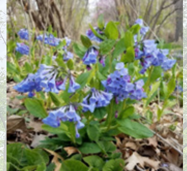
Virginia Bluebells (Mertensia virginica)