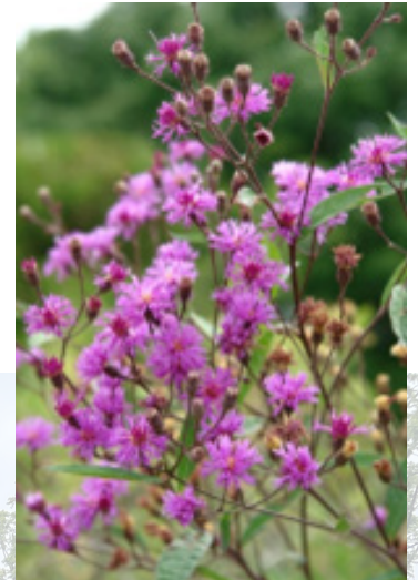
New York Ironweed (Vernonia noveboracensis)