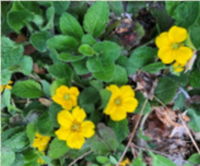
Green and Gold (Chrysogonum virginianum)